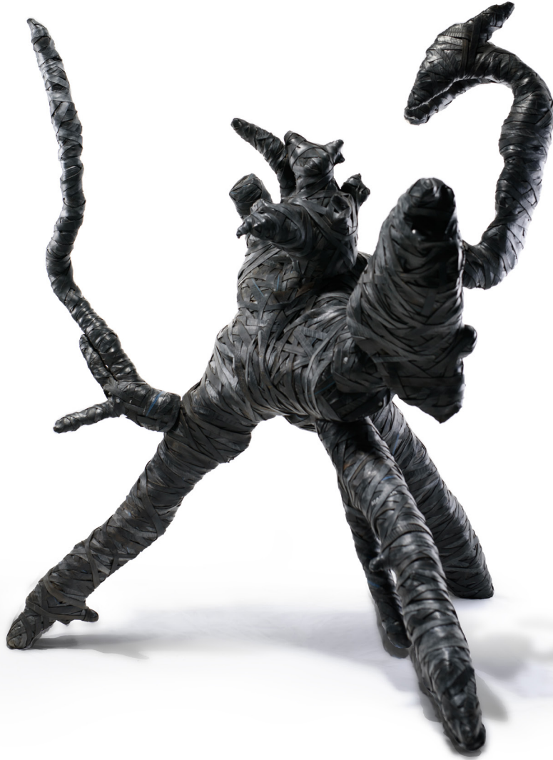
Image: Leggett, W., 2022, Arborico Inversus , Roots and Rubber, 128cm x 170cm x 120cm