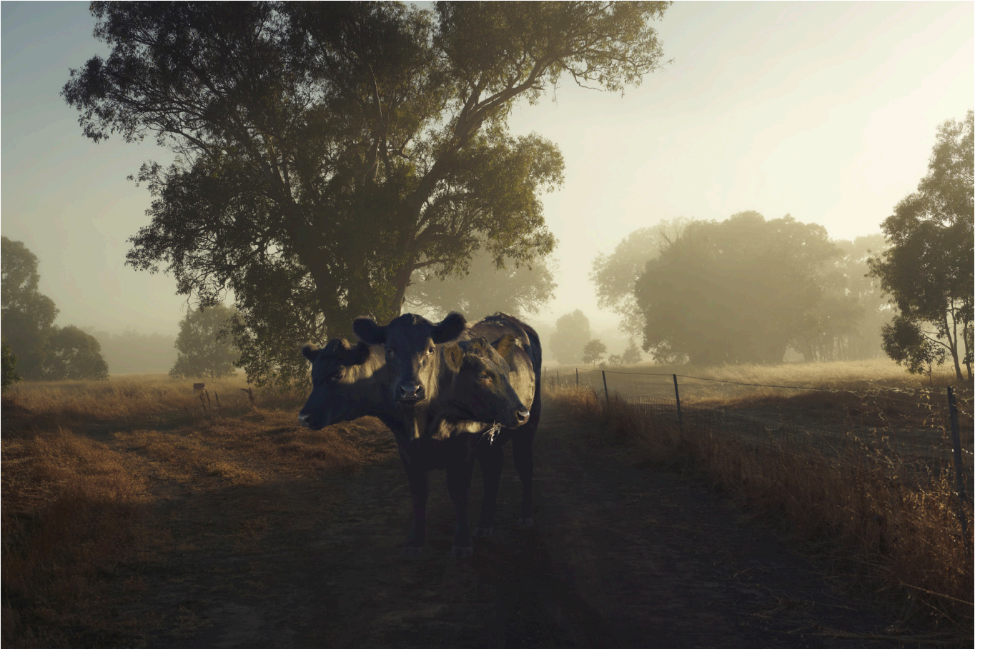
Image: Taylor, B., 2023, Hydra Bos Taurus , photo-media on lightbox, 130cm x 86cm x 10cm