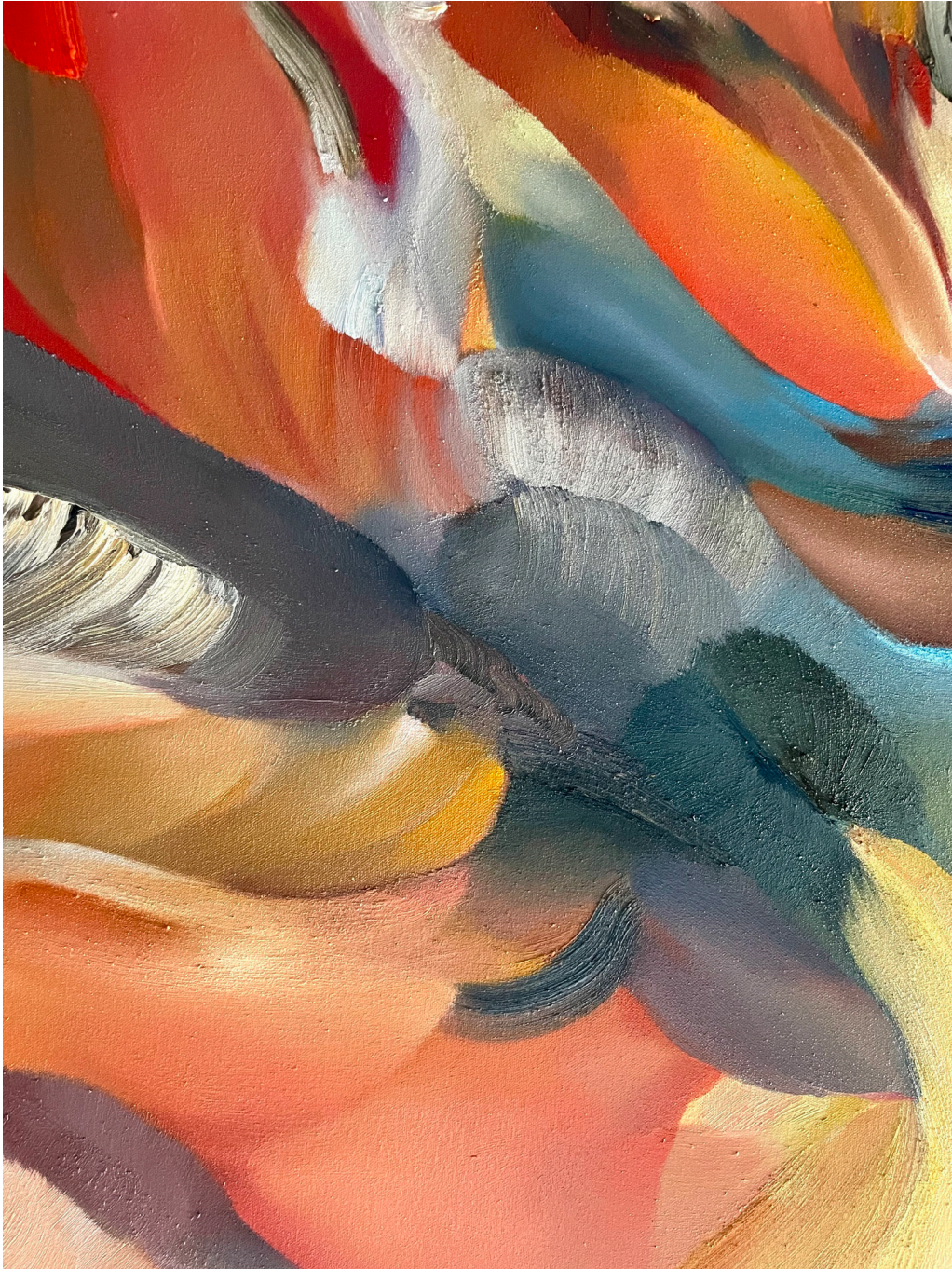
Image: Reisch, S., 2023, Monarch (detail), oil, pumice and wax on canvas, 150cm x 150cm