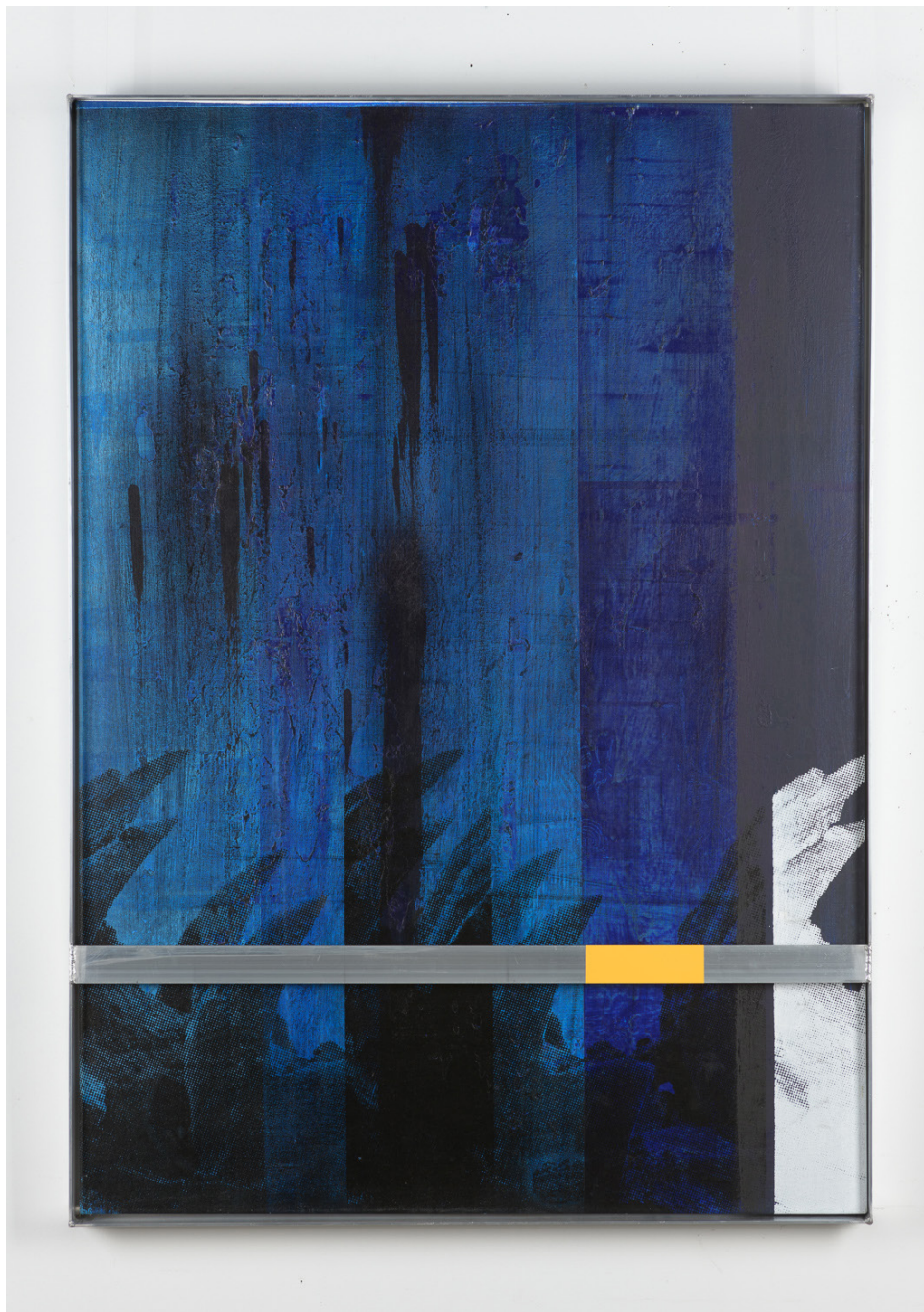
Image: Malton, J., 2022, Vicious , silkscreen print, synthetic polymer, ink, aerosol paint, aluminium, 120cm x 85cm